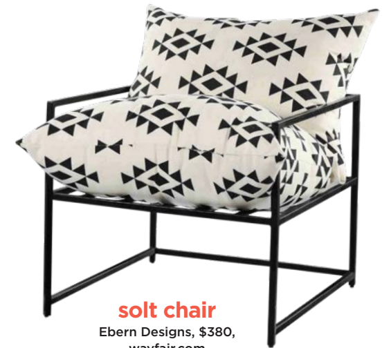
solt chair Ebern Designs, $380, wayfair.com