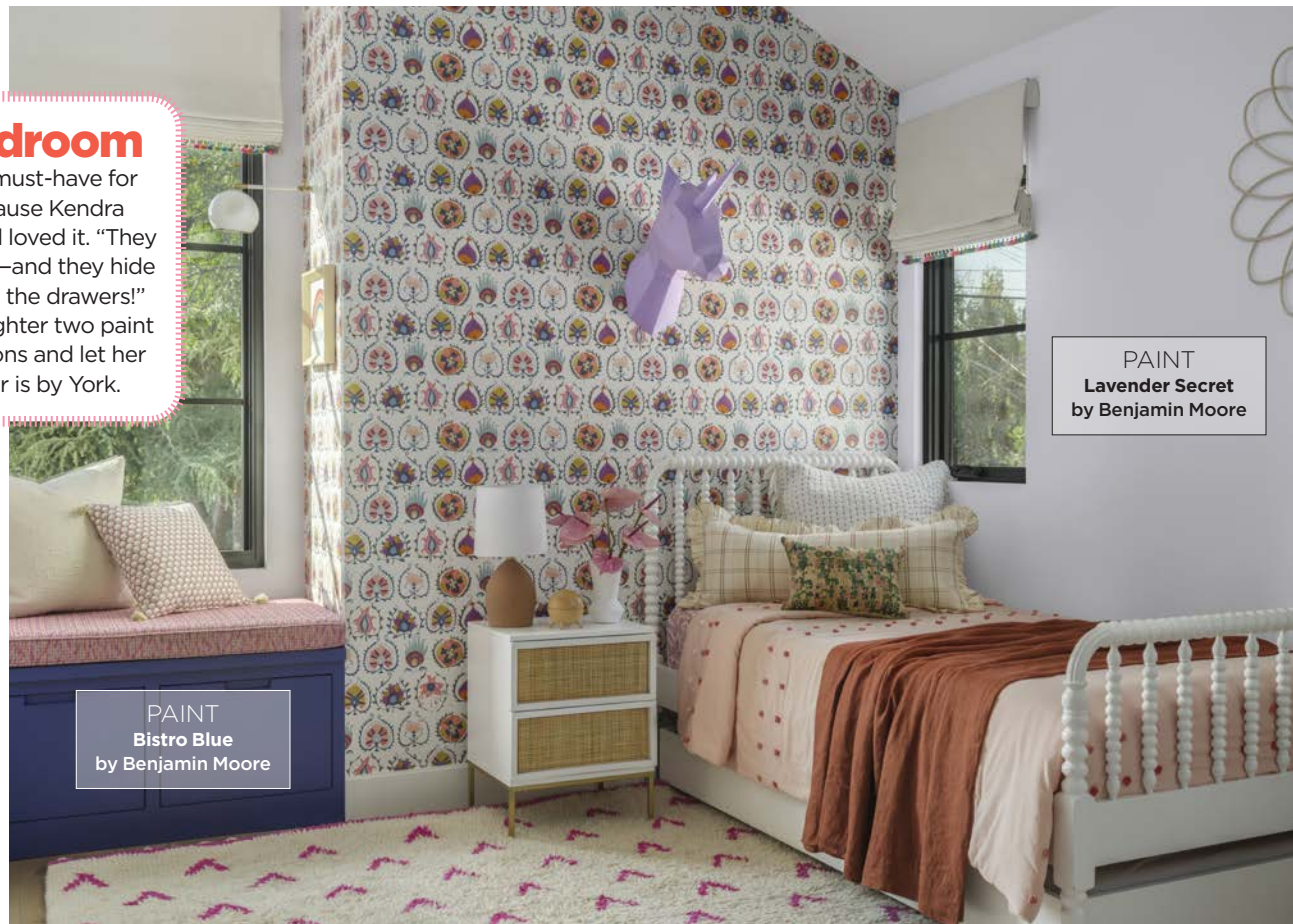
PAINT Bistro Blue by Benjamin Moore