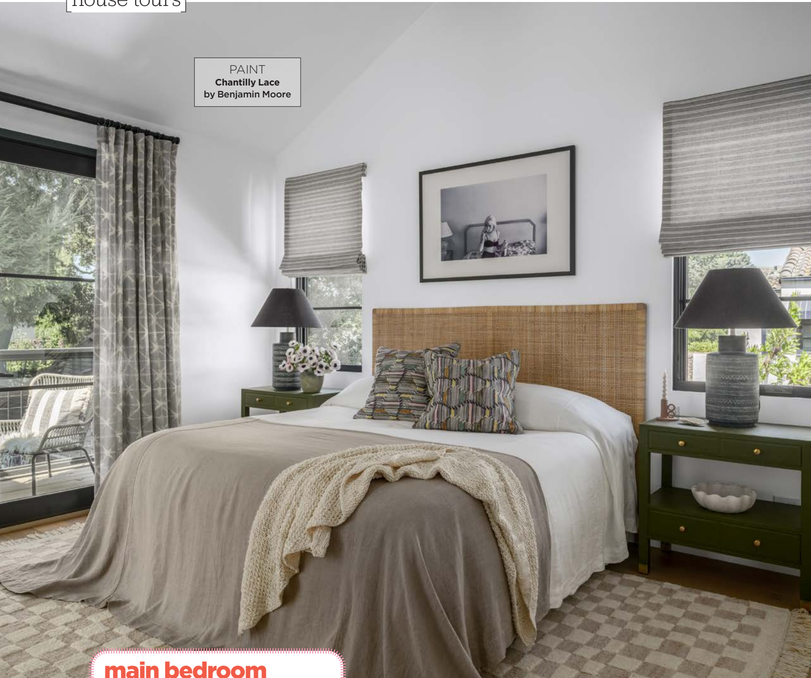
PAINT Chantilly Lace by Benjamin Moore