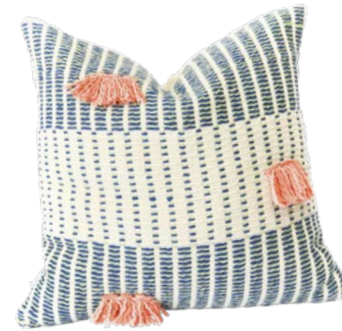
salento pillow cover $92, zuahaza.com