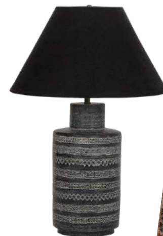
tracey boyd lamp Sonder Living, $470, perigold.com