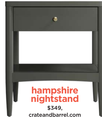
hampshire nightstand $349, crateandbarrel.com