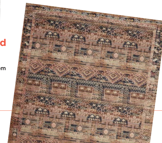
layla rug Lolo, from $206, kohls.com