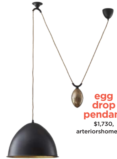
egg drop pendant $1,730, arteriorshome.com