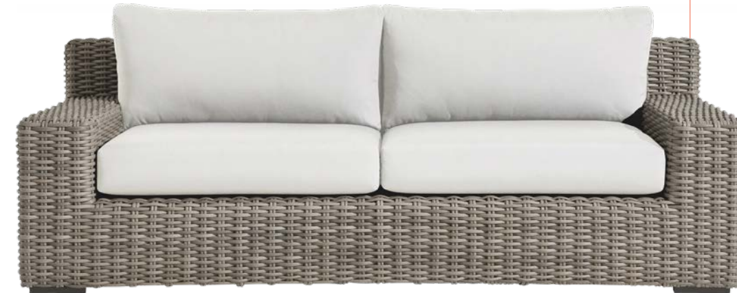
abaco outdoor sofa from $2,299, crateandbarrel.com