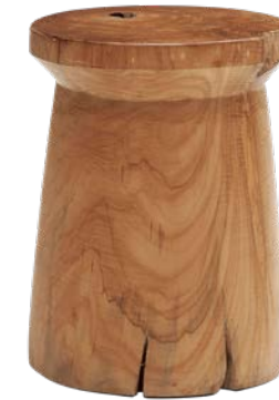
teak stool $399, hausful.com