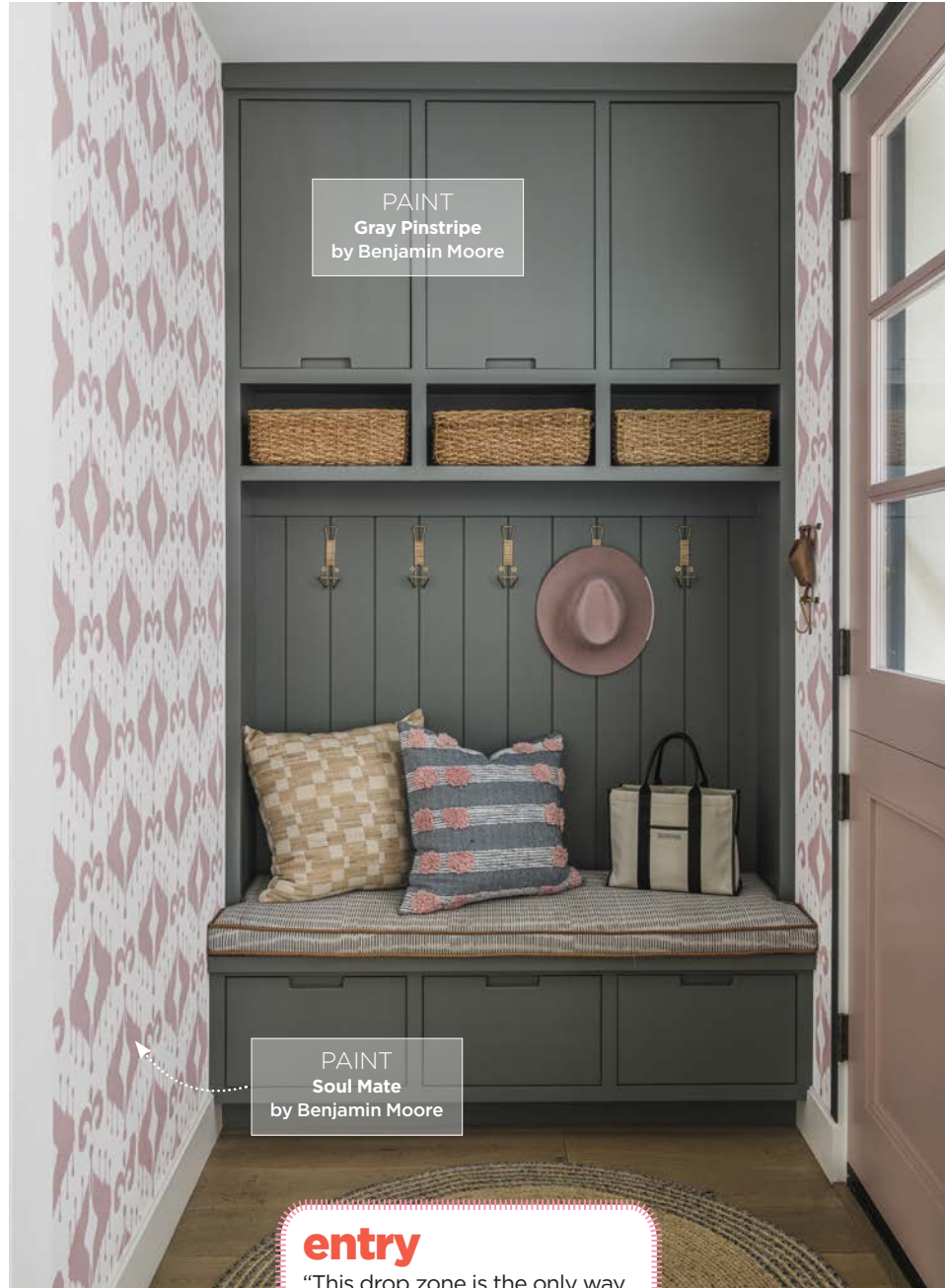
PAINT Gray Pinstripe by Benjamin Moore